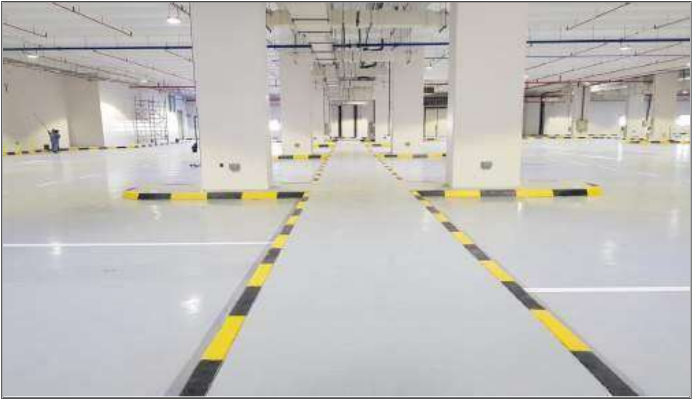
RCA ROYAL GARAGE – SALALAH