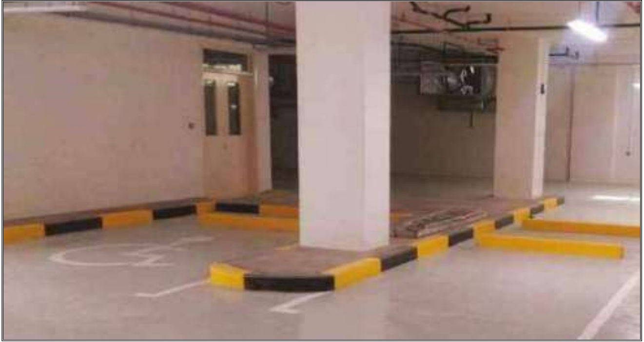
CALEDONIAN COLLEGE – MISFAH