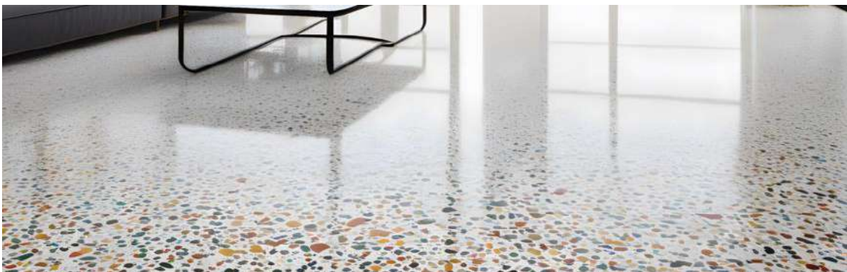
CHAIRMAN VILLA – SAUD BAHWAN GROUP