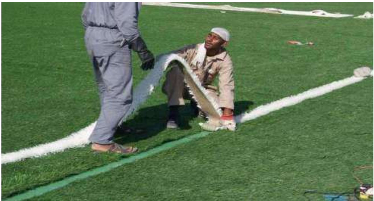
FOOTBALL GROUND – SALALAH