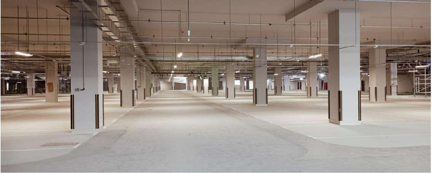
NESTO PROJECT – MABELA