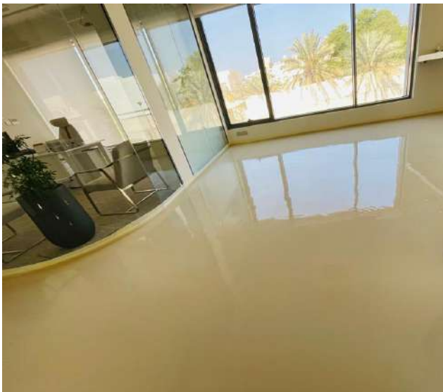
OFFICE BUILDING – AFLAG – AL QURAM