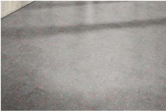
NESTO – BARKA