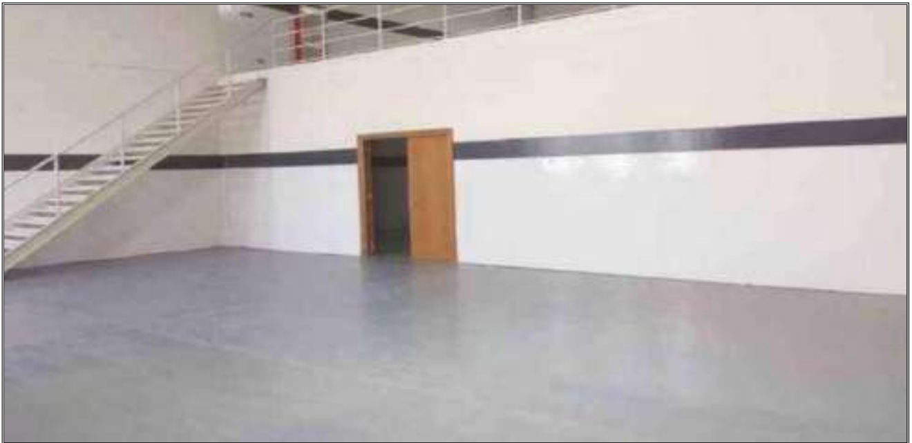
RCA WEARHOUSE – MISFAH