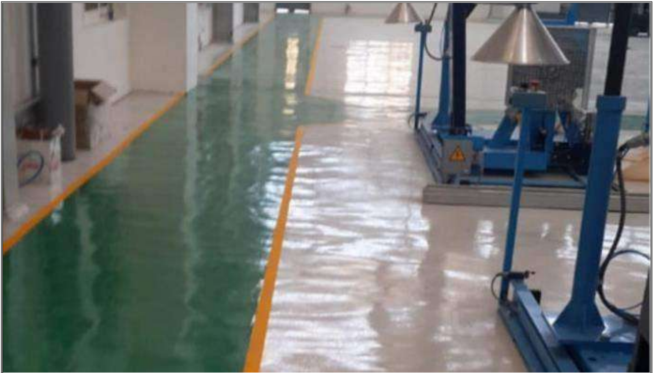
PANEL TECH PROJECT – MISFAH