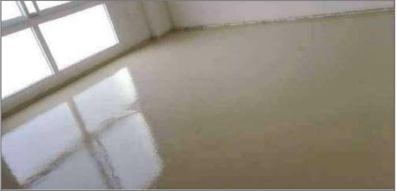
APPARTMENT COMPLEX – SEEB