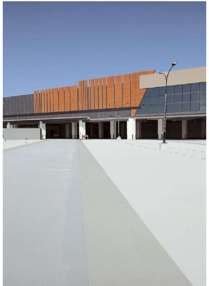
NESTO PROJECT – MABELA