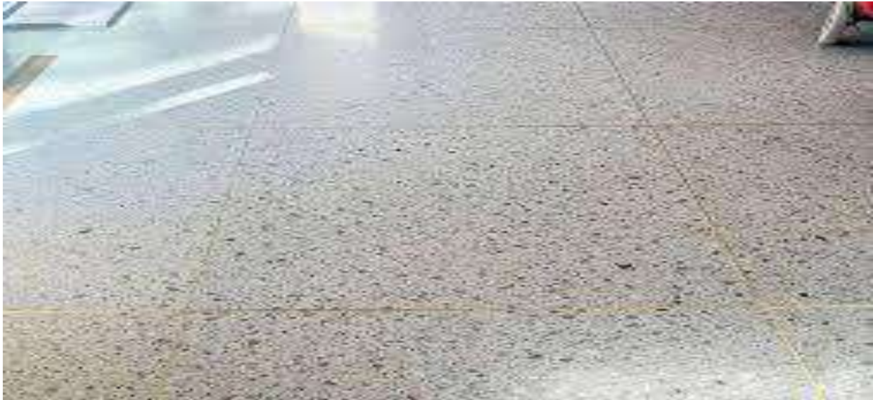
INTERIOR CONCEPT – QURUM