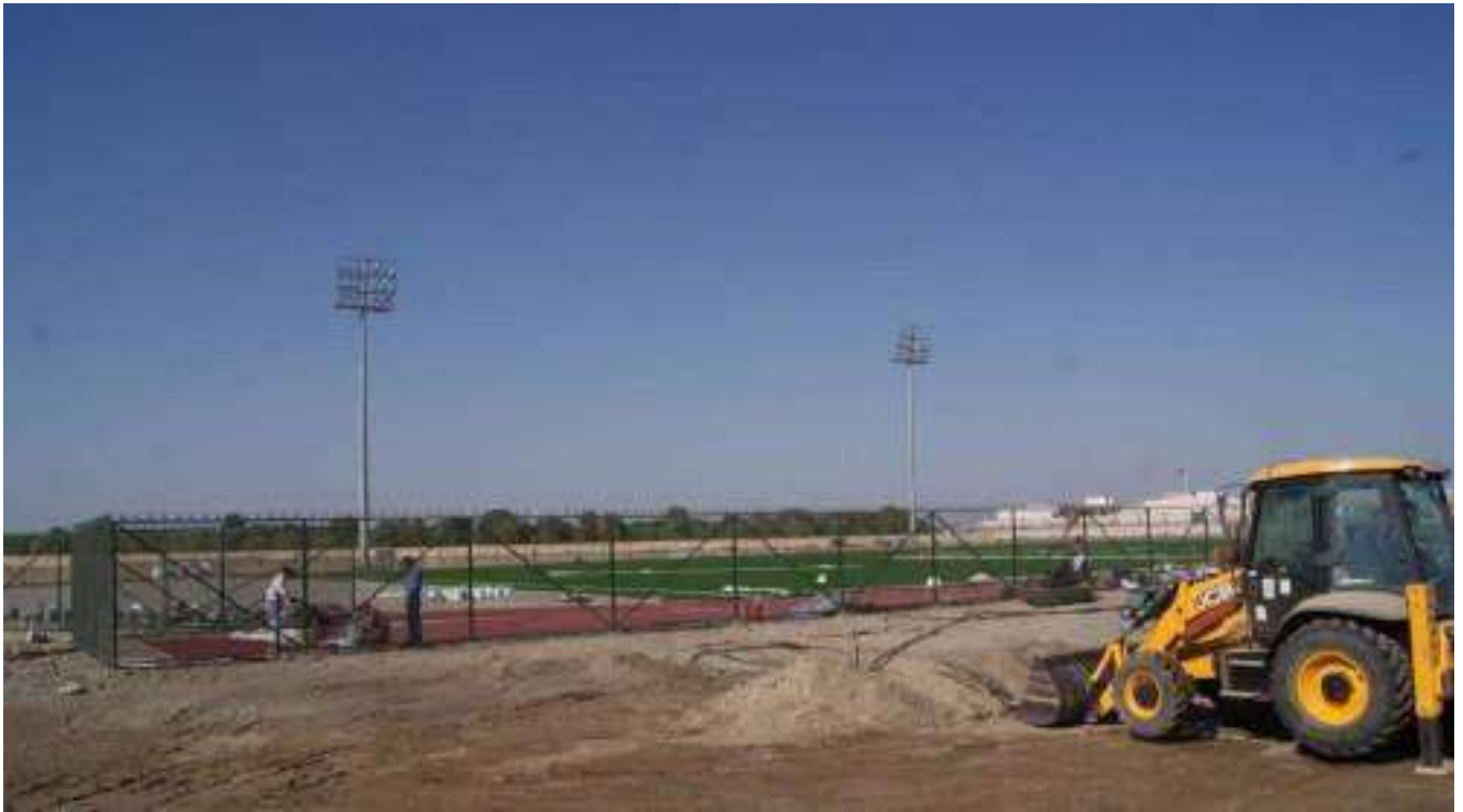
FOOTBALL GROUND – THUMARIAT