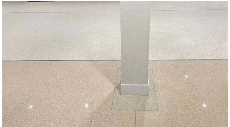
LUXUARY VILLA – AMARATH