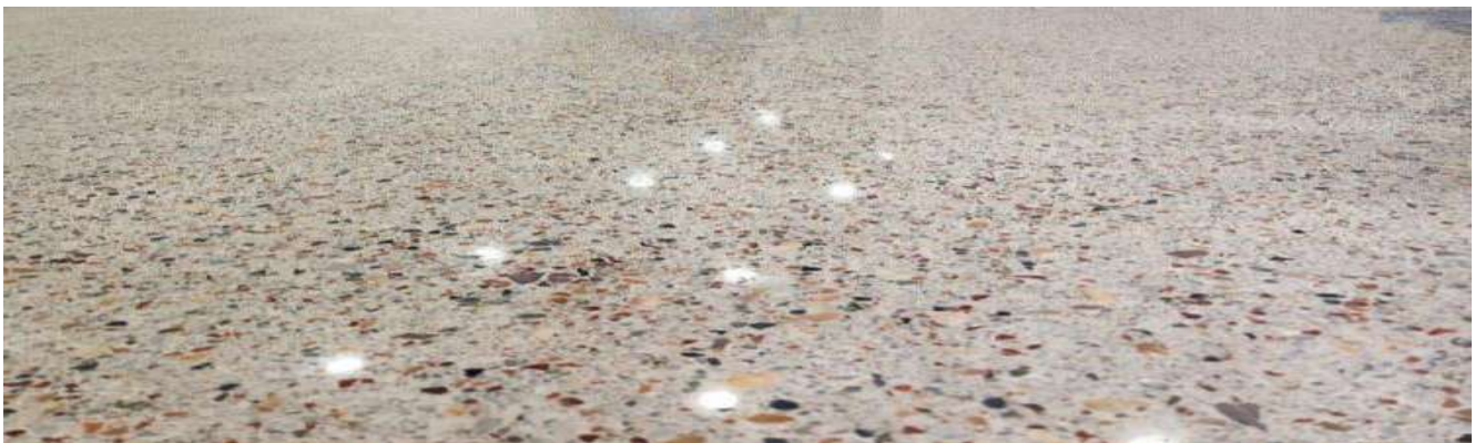
MINISTRY OF EDUCATION – YANQUL