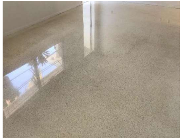
ROYAL GARAGE -SALALAH