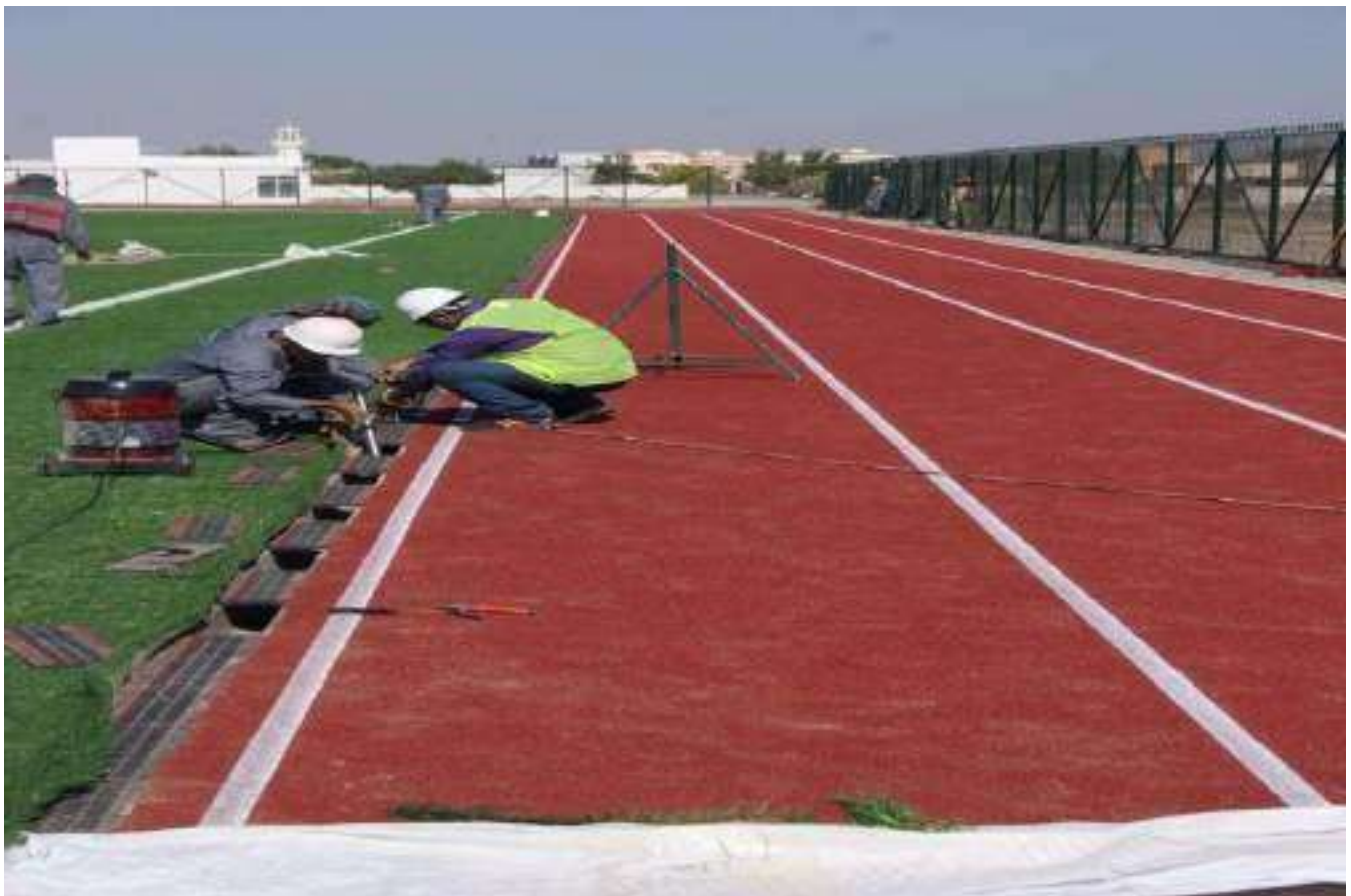
RUNNING TRACK – THUMARIAT