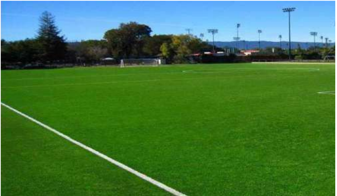
FOOTBALL GROUND – SALALAH