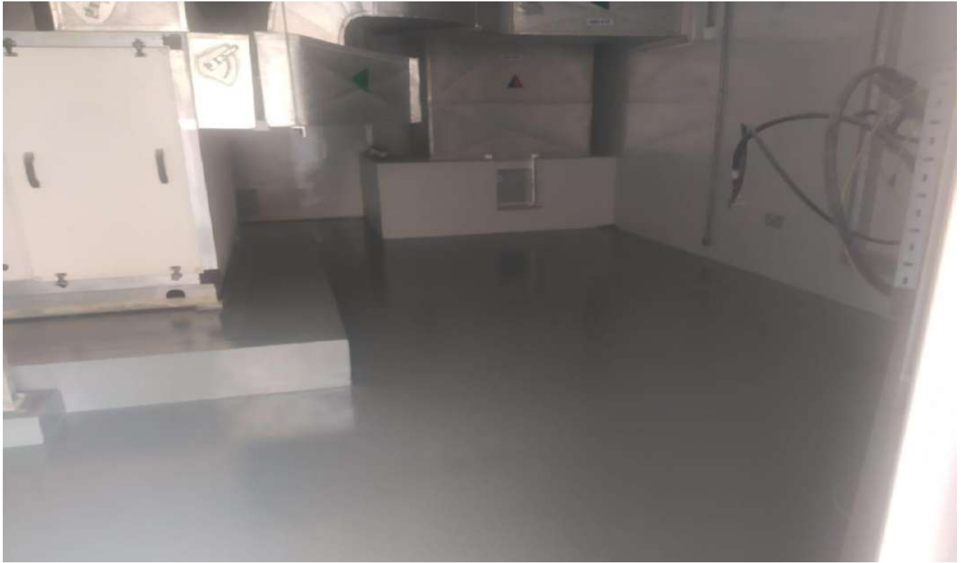
MOD – SOHAR