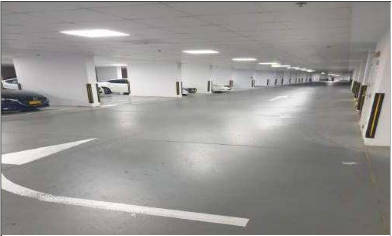
AL FIRDOUS TOWER CAR PARKING